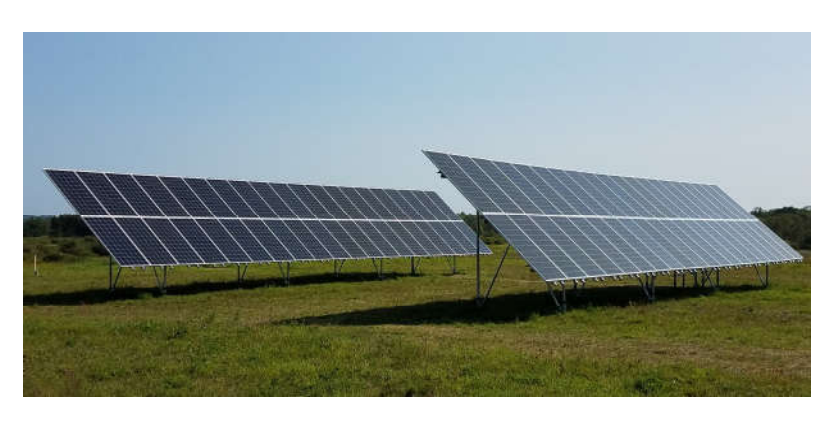
Detroit Lakes Public Utility's 29.3 kW Select Solar Community Solar Garden Detroit Lakes, MN